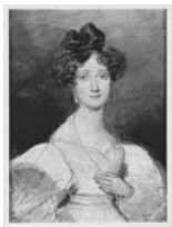
72. Sophie Wilhelmine Großherzogin von Baden (1801-1865), née Princess of Sweden , c. 1832 Pencil and watercolour, 12 x 9 cm Private Collection