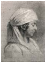
75. Brustbildnis einer älteren Frau mit Kopftuch , 1832 Pencil heightened with white, 44.0 x 31.0 cm Signed and dated lower right Private Collection