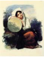
94. Italian Girl Resting on a Tambourine , 1834 Watercolour & pencil on paper, 24.1 x 19.5 cm Signed, dated and inscribed below: Rom im April 1834. Seinem Freunde ... [indecipherable name] zur Erinnerung von Winterhalter Staatliche Museen zu Berlin.