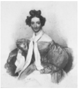
61. Sophie Wilhelmine Großherzogin von Baden (1801-1865), née Princess of Sweden, 1831 Oil on canvas Present location unknown (image known from a lithograph by Winterhalter and Velten)