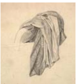
59a. Study of Drapery Folds , c.1830-31 Pencil on paper The Venator Collection, Köln Note: study of drapery folds, which appear in Winterhalter's lithograph of the above portrait.