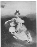
70. Sophie Wilhelmine Großherzogin von Baden (1801-1865), with her son, Wilhelm Prinz von Baden (1829-1891) , 1832

The Cleveland Museum of Art, The Thomas L. Fawick Memorial Collection.