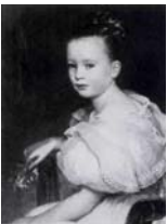
98. Luise Gräfin von Langenstein und Gondelsheim (1826-1900), later Gräfin Douglas , 1834 Oil on canvas, 68.0 x 52.0 cm Signed and dated: Fr Winterhalter fec. 1834 Private Collection