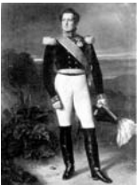
54. Leopold I Großherzog von Baden (1790-1852) , 1831 Oil on canvas, 232 x 150 cm Signed, dated and inscribed lower left: Fr. Winterhalter fec. 1831 Private Collection

© Research, information and most images on this page are copyright. Apart from any fair dealing for the purpose of private study, research, criticism or review, as permitted under the Copyright Act, no part may be reproduced by any process without written permission and full proper acknowledgement.