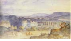
99. Landscape with Schloss Langenstein , c. 1834 Pencil and watercolour on paper, 17 x 29.5 cm Signed and dated, lower right: Fr Winterhalter fecit / 18[34?] . Private Collection