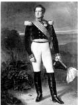
54. Leopold I Großherzog von Baden (1790-1852), 1831 Oil on canvas, 232.0 x 150.0 cm Signed, dated and inscribed lower left: Fr. Winterhalter fec. 1831 Private Collection

© Research, information and most images on this page are copyright. Apart from any fair dealing for the purpose of private study, research, criticism, or review, as permitted under the Copyright Act, no part may be reproduced by any process without written permission and full proper acknowledgement.