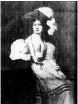
65. Elisabeth Markgräfin von Baden (1802-1864), née Herzogin von Württemberg, 1831, Karlsruhe Oil on board, 40.0 x 29.5 cm Signed and dated lower left: Fr. Winterhalter fecit 1831. Private Collection