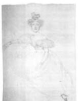
71. Sophie Wilhelmine Großherzogin von Baden (1801-1865), with her son, Wilhelm Prinz von Baden (1829-1891) , c. 1832

Pencil on white laid paper. 37.5 x 27.4 cm