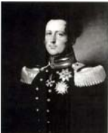
55. Leopold I Großherzog von Baden (1790-1852) , 1831 Oil on canvas, 68 x 48 cm Signed, dated & inscribed: 1831 Fr. Winterhalter fecit Private Collection, on loan to Badisches Landesmuseum Karlsruhe