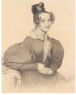
106. Portrait of a Seated Lady , Early to mid 1830s Black lead and grey wash on paper, 34 x 26.4 cm Signed lower right: 'Winterhalter fecit' Private Collection