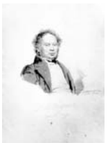
99d. Johann Martin von Wagner (1777-1858) , 1834, Rome Pencil and ink wash, 50.1 x 36.0 cm Signed, dated and inscribed lower right: 'Fr. Winterhalter fecit/ Rom 1834'; inscribed lower centre 'A.M. Wagner / aus Wurzburg' Biblioteca Hertziana, Rome