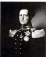
55. Leopold I Großherzog von Baden (1790-1852), 1831 Oil on canvas, 68.0 x 48.0 cm Signed, dated and inscribed: 1831 Fr. Winterhalter fecit Private Collection, on loan to Badisches Landesmuseum, Karlsruhe