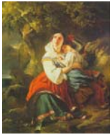
90. The Approaching Storm , 1834, Rome Oil on canvas, 47.7 x 38.1 cm Signed, dated and inscribed lower right: F Winterhalter Roma 1834 Private Collection