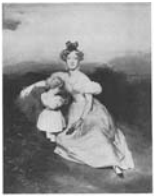
70. Sophie Wilhelmine Großherzogin von Baden (1801-1865), with her son, Wilhelm Prinz von Baden (1829-1891) , 1832 Oil on canvas, 48.2 x 38.0 cm Signed and dated lower right: Fr. Winterhalter fec. 1832 Private Collection