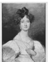
72. Sophie Wilhelmine Großherzogin von Baden (1801-1865), née Princess of Sweden , c. 1832 Pencil and watercolour, 12.0 x 9.0 cm