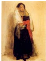
85. Study of an Italian Woman holding an Infant , c. 1833 – 34 Oil on card, 33.0 x 22.5 cm Private Collection