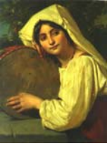
93b. Young Girl with a Tambourine , c. 1834, Rome Oil on canvas, 62 x 49 cm V.M. & A.M. Vasnetzov Regional Museum of Fine Arts, Kirov, Russia