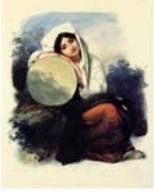
94. Italian Girl Resting on a Tambourine , 1834 Watercolour and pencil on paper, 24.1 x 19.5 cm Signed, dated and inscribed below: Rom im April 1834. Seinem Freunde ... [indecipherable name] zur Erinnerung von Winterhalter Staatliche Museen zu Berlin