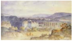
99. Landscape with Schloss Langenstein , c. 1834 Pencil and watercolour on paper, 17.0 x 29.5 cm Signed and dated lower right: Fr Winterhalter fecit / 18[34?] . Private Collection