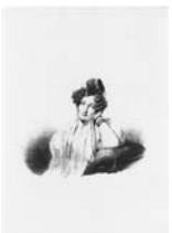
60. Sophie Wilhelmine Großherzogin von Baden (1801-1865), née Princess of Sweden, 1831 Pencil and watercolour, 34.4 x 26.2 cm Signed and dated lower right: Fr Winterhalter fecit 1831 Private Collection