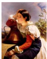
88. Young Italian Girl by the Well , c. 1833-34 Oil on canvas, 92.0 x 74.0 cm Signed lower left: F.X. Winterhalter Augustinermuseum, Freiburg-im-Bresgau