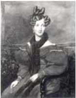
59. Sophie Wilhelmine Großherzogin von Baden (1801-1865), née Princess of Sweden, 1831 Oil on canvas, 39.8 x 29.0 cm Signed and dated lower right: Fr. Winterhalter fecit. 1831 Private Collection