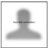
93. The Baron von Herring , 1834 Oil on canvas Signed and dated 1834 Present location unknown