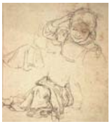
91a. Preparatory Sketches for "By a Garden Pool" , 1834, Rome Pencil and charcoal on paper The Venator Collection, Köln