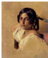
84. Study of an Italian Girl , c. 1833-34 Oil on canvas, 57.0 x 46.0 cm Private Collection

Signed, dated and inscribed lower right: Fr Winterhalter fec. / Roman 1833 Staatliche Kunsthalle, Karlsruhe