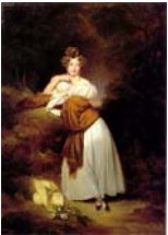
69. Sophie Wilhelmine Großherzogin von Baden (1801-1865), née Princess of Sweden , c. 1832