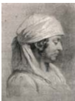
75. Brustbildnis einer älteren Frau mit Kopftuch , 1832 Pencil heightened with white, 44 x 31 cm Signed and dated lower right Private Collection