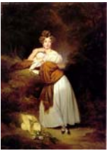
69. Sophie Wilhelmine Großherzogin von Baden (1801-1865), née Princess of Sweden , c. 1832 Oil on canvas, 39.5 x 29.0 cm Illegible signature and date lower left: fr Winterh... 183... , Cleveland Museum of Art, The Thomas L. Fawick Memorial Collection