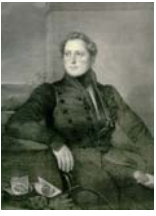
56. Leopold I Großherzog von Baden (1790-1852), 1831 Oil on canvas Present location unknown (image known from a lithograph)