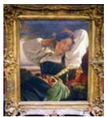
86. Mädchen aus den Sabiner Bergen (Study of a Sleeping Albanian Girl) , c. 1833-34 Oil on canvas, 74.5 x 63.0 cm Concordia University, Montreal, Canada