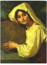
93b. Young Girl with a Tambourine , c. 1834, Rome Oil on canvas, 62.0 x 49.0 cm V.M. and A.M. Vasnetzov Regional Museum of Fine Arts, Kirov, Russia