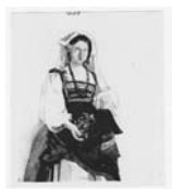
87. Woman in Italian Costume , c. 1833-34 Watercolour over traces of pencil, 16.5 x 11.0 cm Private Collection