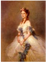
788. Alexandra, Princess of Wales (1844-1925), later Queen Alexandra, née Princess of Denmark, 1864, London Oil on canvas, 162.2 x 114 cm Signed and dated, bottom left: Fr Winterhalter 1864 HM the Queen, British Royal Collections, Buckingham Palace (inv no 2996)