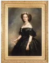
753. Sophie, Queen of the Netherlands (1818-1871), née Herzogin von Württemberg , 1863 Oil on canvas, 132 x 92 cm Signed and dated 1863 The Rijksmuseum, Amsterdam (inv no A1702)