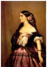
755. Mme Adelina Patti (1843-1919) , 1863, Paris Oil on canvas, 110 x 77.9 cm Signed and dated, lower left-hand corner: F. Winterhalter 1863 Private Collection