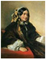
704. Victoria, Duchess of Kent (1768-1861), née Prinzessin von Sachsen-Coburg-Saalfeld , 1861, London (posthumous) Oil on canvas, 91.1 x 71.1 cm Signed and dated: Fr Winterhalter / 1861 . Inscribed on the back with the names of artist and sitter and as painted from recollection, June 1861. HM the Queen, British Royal Collections, Buckingham Palace (Inv No. 2242)