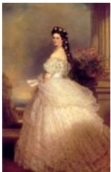
791. Elisabeth, Empress of Austria, Queen of Hungary (1837-1898), née Herzogin in Bayern, 1865, Vienna Oil on canvas, 255 x 133 cm Signed and dated, lower left: F.X. Winterhalter. 1865 Hofburg