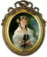
752. Duchesse Sophie de Morny (1838-1896), née Princess Troubetzkaia , 1863, Paris Oil on canvas, 94 x 73 cm, oval Signed, dated and inscribed, to left: fr Winterhalter / 1863 Musée National du Château de Compiègne