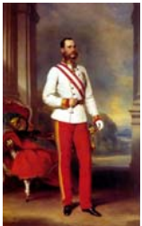
790. Franz Joseph I, Emperor of Austria, King of Hungary (1830-1916), 1865, Vienna Oil on canvas, 255 x 133 cm Signed and dated, lower left: F.X. Winterhalter. 1865 Hofburg