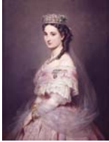
780. Carlotta, Empress of Mexico (1840-1927), née Princesse Charlotte de Belgique , 1864, Paris Oil on canvas, 100.3 x 75.3 cm Signed, dated and inscribed as painted in Paris, 1864 Hearst Castle, San Simeon, California