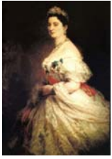
769. Princess Ekaterina Alexandrovna Dadiani, Queen Regent of Mingrelia (1816-1882), née Princess Tchavtchavadze, c. 1864-65 Oil on canvas Dadiani Palace's State History & Architecture Museum, Zugdidi, Georgia (Gruzia)