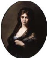
803. Lady Mary Douglas-Hamilton (1850-1922), later Princesse de Monaco , c. 1865-66 Oil on canvas, 80.5 x 64 cm Private Collection