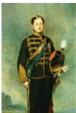
787. Albert Edward, The Prince of Wales (1841-1910), later Edward VII, King of Great Britain & Ireland , 1864, London Oil on canvas, 162.2 x 114 cm. Signed and dated, bottom left: Fr Winterhalter 1864 HM the Queen, British Royal Collections, Buckingham Palace (inv no 2995)