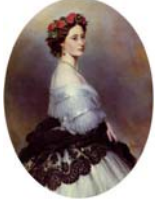
701. Alice, Princess of Great Britain & Ireland (1843-1878), later Grand Duchess of Hesse & by the Rhine , 1861, London Oil on canvas, 118.7 x 88.9 cm Signed and dated lower right: Fr Winterhalter / 1861 , HM the Queen, British Royal Collections, Buckingham Palace (Inv no 1643)