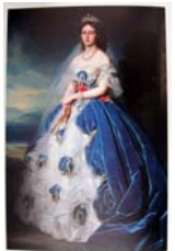
809. Olga, Queen of Württemberg (1822-1892), née Grand Duchess of Russia , 1865 Oil on canvas, 240 x 150 Signed & dated lower right centre: ' Fr. Winterhalter 1865 ' Württembergisches Landesmuseum, Stuttgart