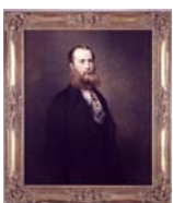
779. Maximilian I, Emperor of Mexico (1832-1867), né Archduke of Austria, 1864, Paris Oil on canvas, 100.3 x 82 cm Signed, dated and inscribed as painted in Paris, 1864