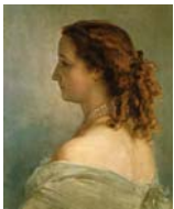
698. Eugénie, Empress of the French (1826-1920), née Condessa de Montijo de Teba de Guzman , 1861, Paris Oil on canvas, 54.5 x 45.5 cm (approx) Signed and dated lower left: Fr Winterhalter / 1861 , Present location unknown / disputed