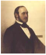
700. Prince Albert the Prince Consort (1819-1861) , 1861, London (posthumous) Oil on canvas, 76 x 63.5 cm Signed and dated: f. Winterhalter / 28 December 1861 Private Collection