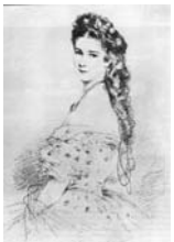
792. Elisabeth, Empress of Austria, Queen of Hungary (1837-1898), née Herzogin in Bayern, 1865, Vienna Pencil on paper Signed lower right: F.X. Winterhalter Present location unknown