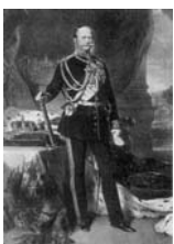
705. Wilhelm I, Emperor of Germany & King of Prussia (1797-1888) , 1861 Oil on canvas, 271 x 180 cm