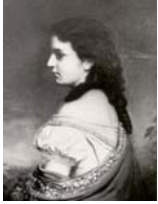
789. Marie-Therese, Prinzessin von Württemberg (1845-1927), née Archduchess of Austria, c. 1864 Oil on canvas Present location unknown