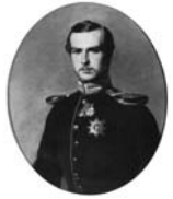
703. Ludwig IV, Grand Duke of Hesse & by the Rhine (1837-1892) , 1861, London Oil on canvas, 75.6 x 61 cm, oval Inscribed on the back with the names of artist and sitter and the date, June 1861 HM the Queen, British Royal Collections, Osborne House.