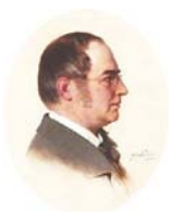
810. Dr Carl Uhland , mid to late 1860s Oil on canvas, 60.5 x 50.5 cm