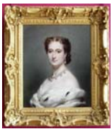
774. Eugénie, Empress of the French (1826-1920), née Condessa de Montijo de Teba de Guzman, 1864 Oil on canvas, 60 x 54 cm Signed and dated lower left: f Winterhalter 1864 Musée National du Château de Compiègne