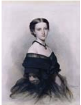
702. Helena, Princess of Great Britain & Ireland (1846-1923), later Fürstin von Schleswig-Holstein-Sonderburg-Augustenburg , 1861, London Oil on canvas, 53.7 x 40.6 cm Signed and dated lower right: Fr Winterhalter / 1861 . Inscribed on the back with the names of artist and sitter. HM the Queen, British Royal Collections, Windsor Castle (inv no 650)