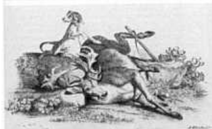
10. Two Hunting Scenes

1819, Freiburg Pencil on paper Presumably in a Private Collection