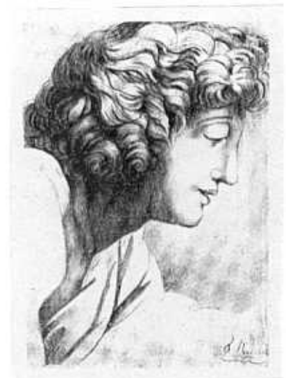
13. Classical Profile

1820 Pencil on paper, 48 x 32 cm Signed & dated lower left: F. Winterhalter / 1820 Private Collection