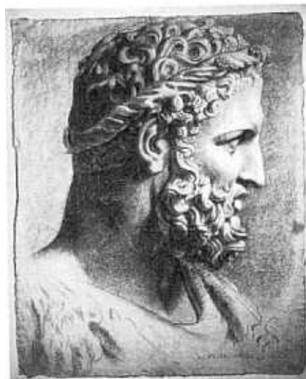
11. Study of an Antique Profile

1819, Freiburg Pencil on paper Signed, dated & inscribed lower right: [...] Febr. 1819 Winterhalter Private Collection